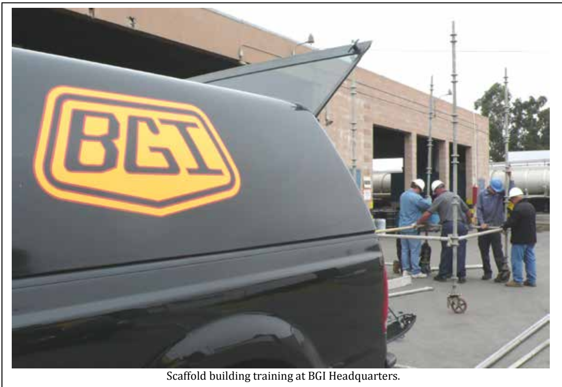
Scaffold building training at BGI Headquarters.

Your permits contain specific and general conditions, references to the DOT, EPA or OSHA regulations, and adoption of commitments made in your business or facilities permit application. BGI environmental consultants ensure that you are in compliance with all regulatory and permit conditions.