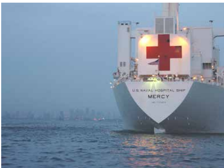
BGI manages all military medical waste coming into San Diego port

Sewer & septic cleaning pumping and disposal