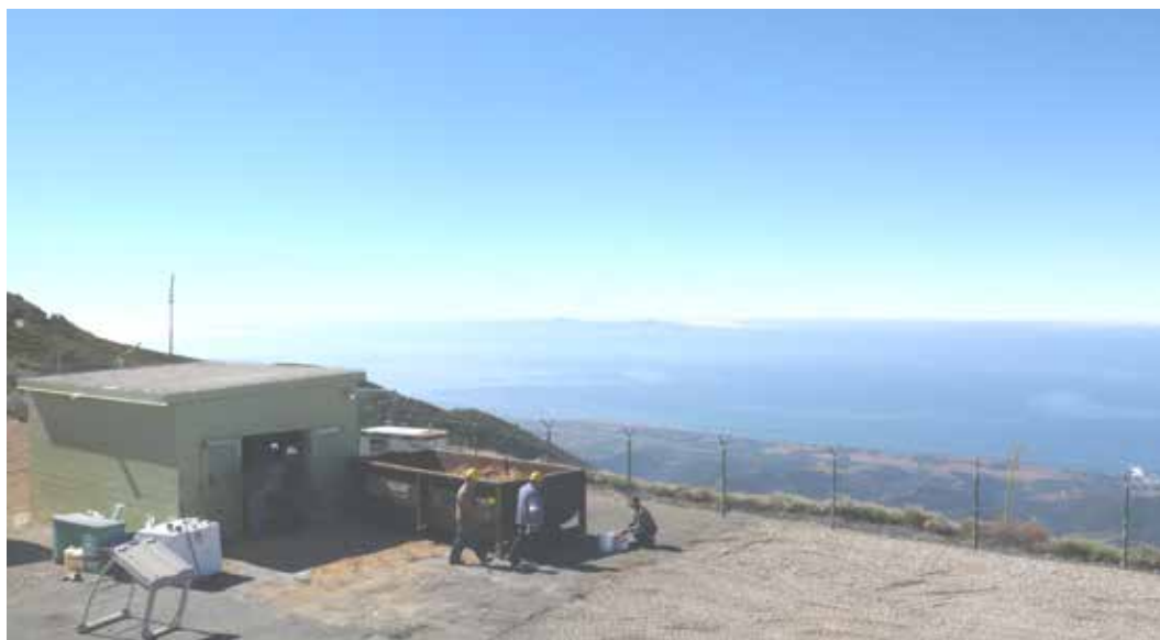
View from Santa Ynez Peak at Vandenberg AFB monitoring station.

Travis Air Force Base Operations Maintenance of Hazardous Waste Management Facility Container Processing Facility