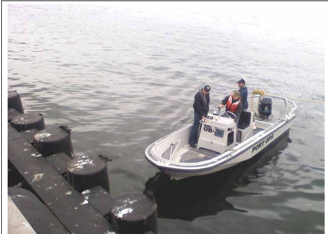
Facility Response Team Training (RFT) at Point Hueneme with Port Operations Personnel

BGI's safety and environmental consultants will provide you with an audit report that will identify areas of potential non-compliance that you can address before an EPA, OSHA, or DOT inspection.