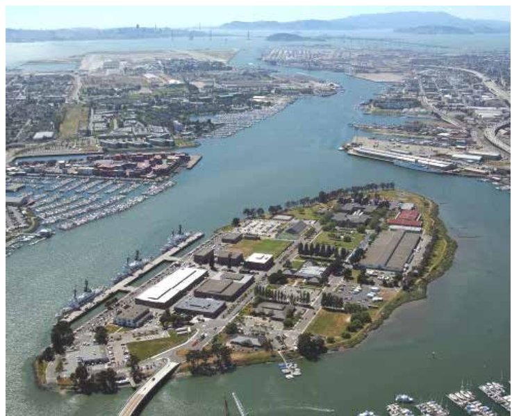
The BGI team stationed on Coast Guard Island manages all the hazardous waste and recycling.

Marine Chemist inspection certification for hot work