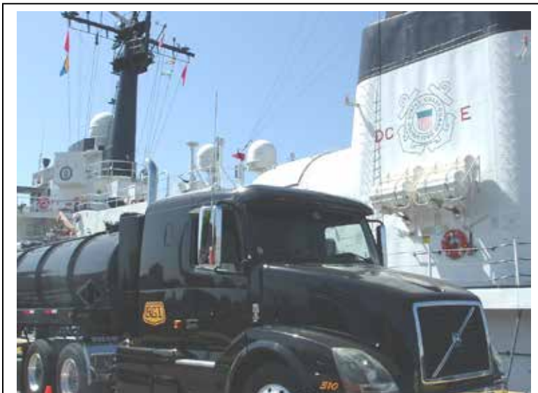
Bilge pumping the CGC Morgenthau on Alameda Island